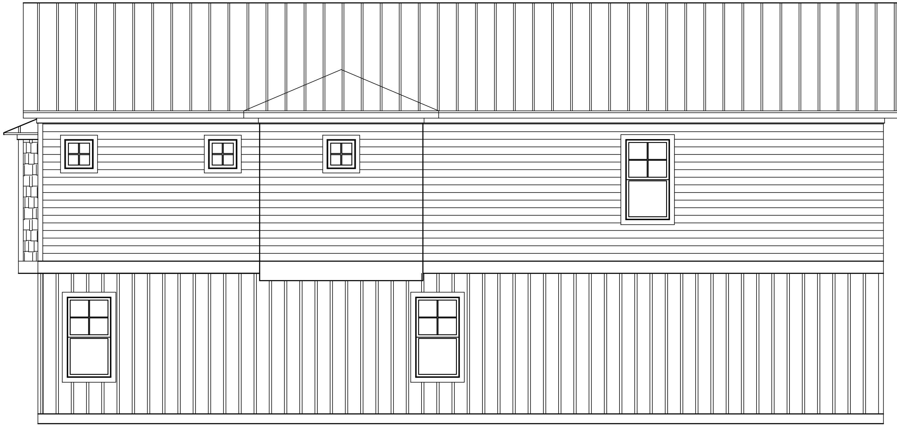
RIGHT ELEVATION 1/4" = 1'-0"