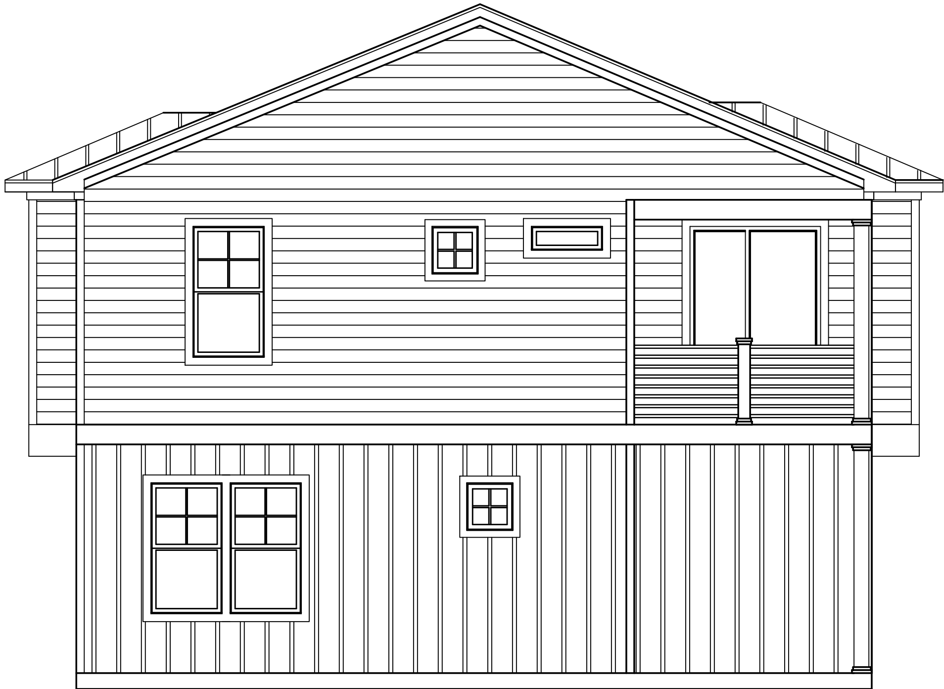
REAR ELEVATION 1/4" = 1'-0"

*Engineers seal does not include construction means, methods, techniques, sequences, procedures or safety precaution. *Any deviations or discrepancies on plans are to be brought to the immediate attention of Engineer. Failure to do so will void Engineer's liability. *Please review these documents carefully. Engineer will interpret that all dimensions, recommendations, etc. presented in these documents were deemed acceptable once construction begins. *Any changes made without written consent of Engineer will void Engineer's liability.