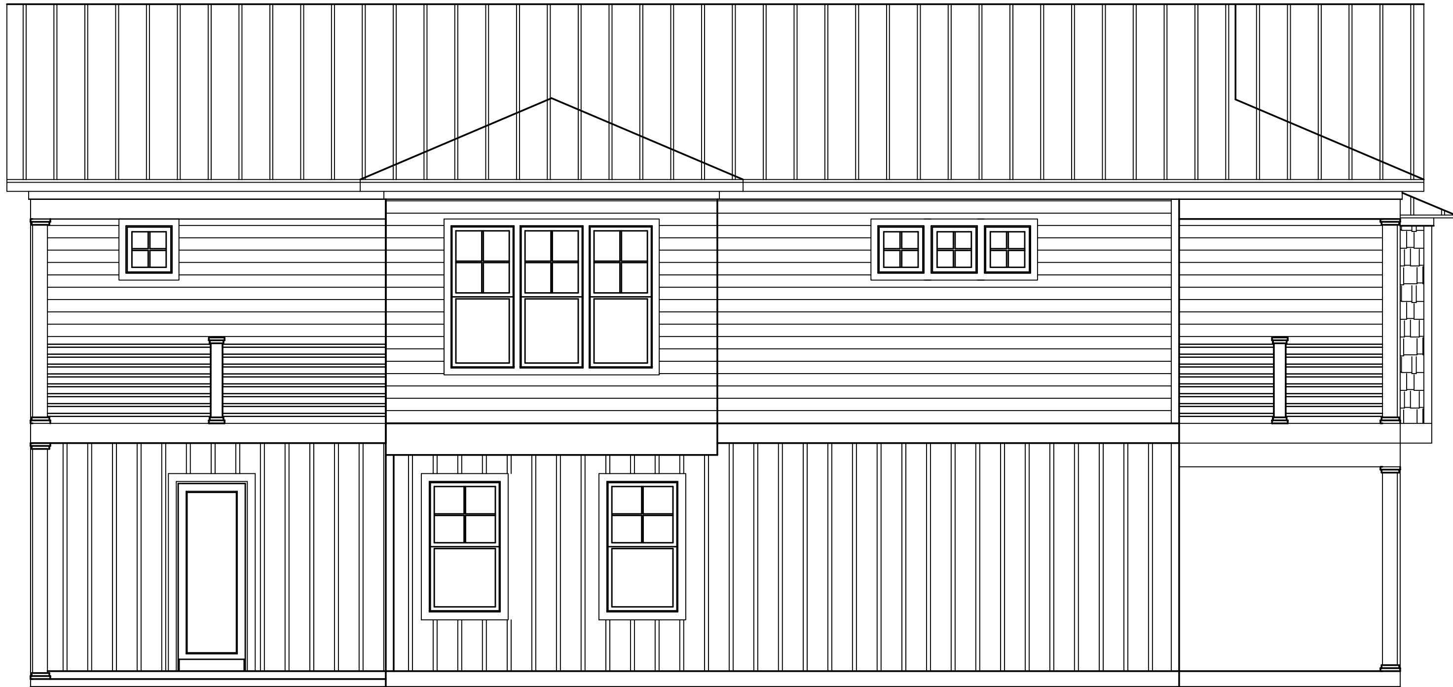
LEFT ELEVATION 1/4" = 1'-0"