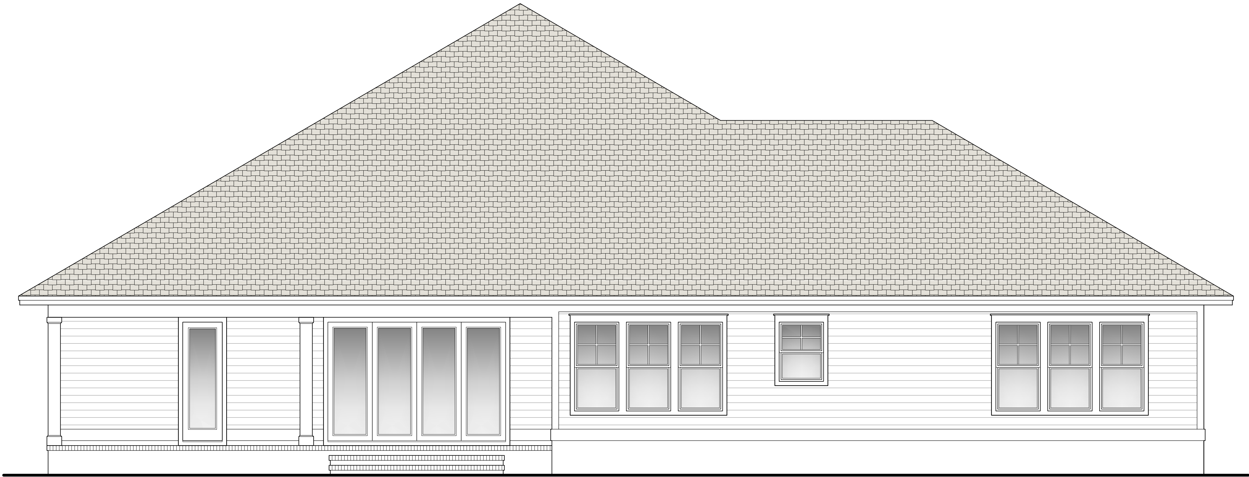
1 REAR ELEVATION A4 SCALE: 1/4" = 1'

© COPYRIGHT 2022 RICHARD WALLACE BUILDER ALL PRELIMINARY AND FINAL CONSTRUCTION DRAWINGS ARE COPYRIGHTED AND REMAIN THE PROPERTY OF RICHARD WALLACE BUILDER AND CANNOT BE REPRODUCED, TRANSFERRED OR UTILIZED FOR ANY PURPOSE EXCEPT FOR THE ONE TIME USE IN CONSTRUCTION FOR THE ADDRESS LISTED IN THE TITLE BLOCK. FLOOR PLANS OR ELEVATIONS ARE FOR ILLUSTRATIVE PURPOSES ONLY. THE ACTUAL HOME, AS BUILT, MAY DEViate FROM THE PLANS OR ELEVATIONS BECAUSE OF PERSONAL SELECTIONS, ENGINEERING CONSTRAINTS OR FIELD CONDITIONS.