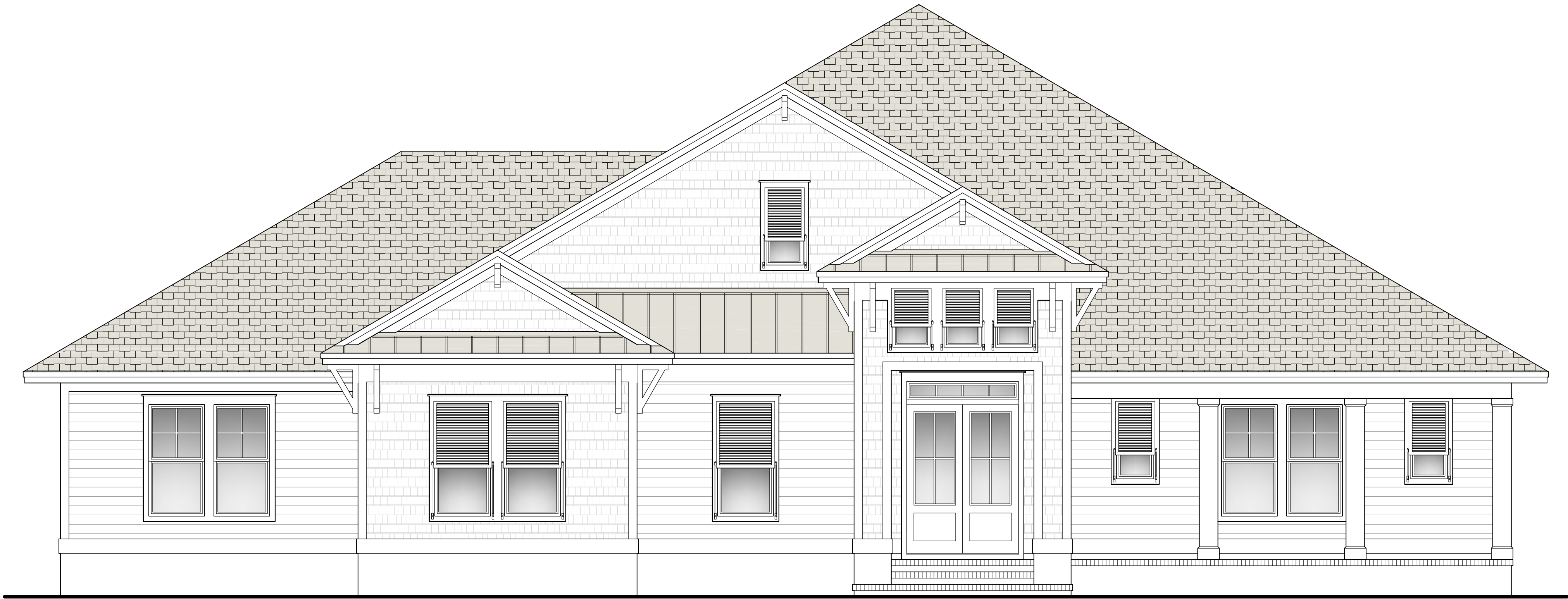
1 FRONT ELEVATION A3 SCALE: 1/4" = 1'

© COPYRIGHT 2022 RICHARD WALLACE BUILDER ALL PRELIMINARY AND FINAL CONSTRUCTION DRAWINGS ARE COPYRIGHTED AND REMAIN THE PROPERTY OF RICHARD WALLACE BUILDER AND CANNOT BE REPRODUCED, TRANSFERRED OR UTILIZED FOR ANY PURPOSE EXCEPT FOR THE ONE TIME USE IN CONSTRUCTION FOR THE ADDRESS LISTED IN THE TITLE BLOCK. FLOOR PLANS OR ELEVATIONS ARE FOR ILLUSTRATIVE PURPOSES ONLY. THE ACTUAL HOME, AS BUILT, MAY DEVIATE FROM THE PLANS OR ELEVATIONS BECAUSE OF PERSONAL SELECTIONS, ENGINEERING CONSTRAINTS OR FIELD CONDITIONS.