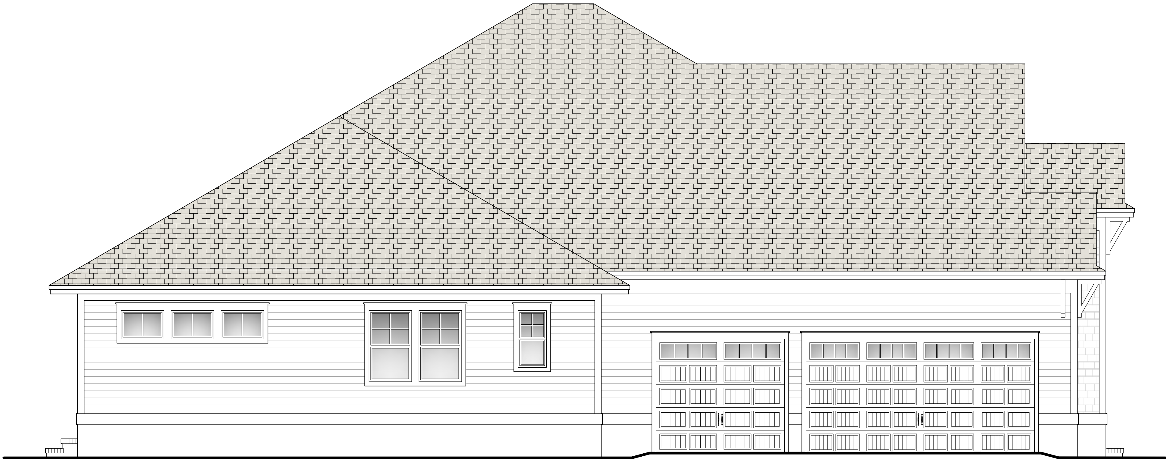
2 LEFT ELEVATION A3 SCALE: 1/4" = 1'