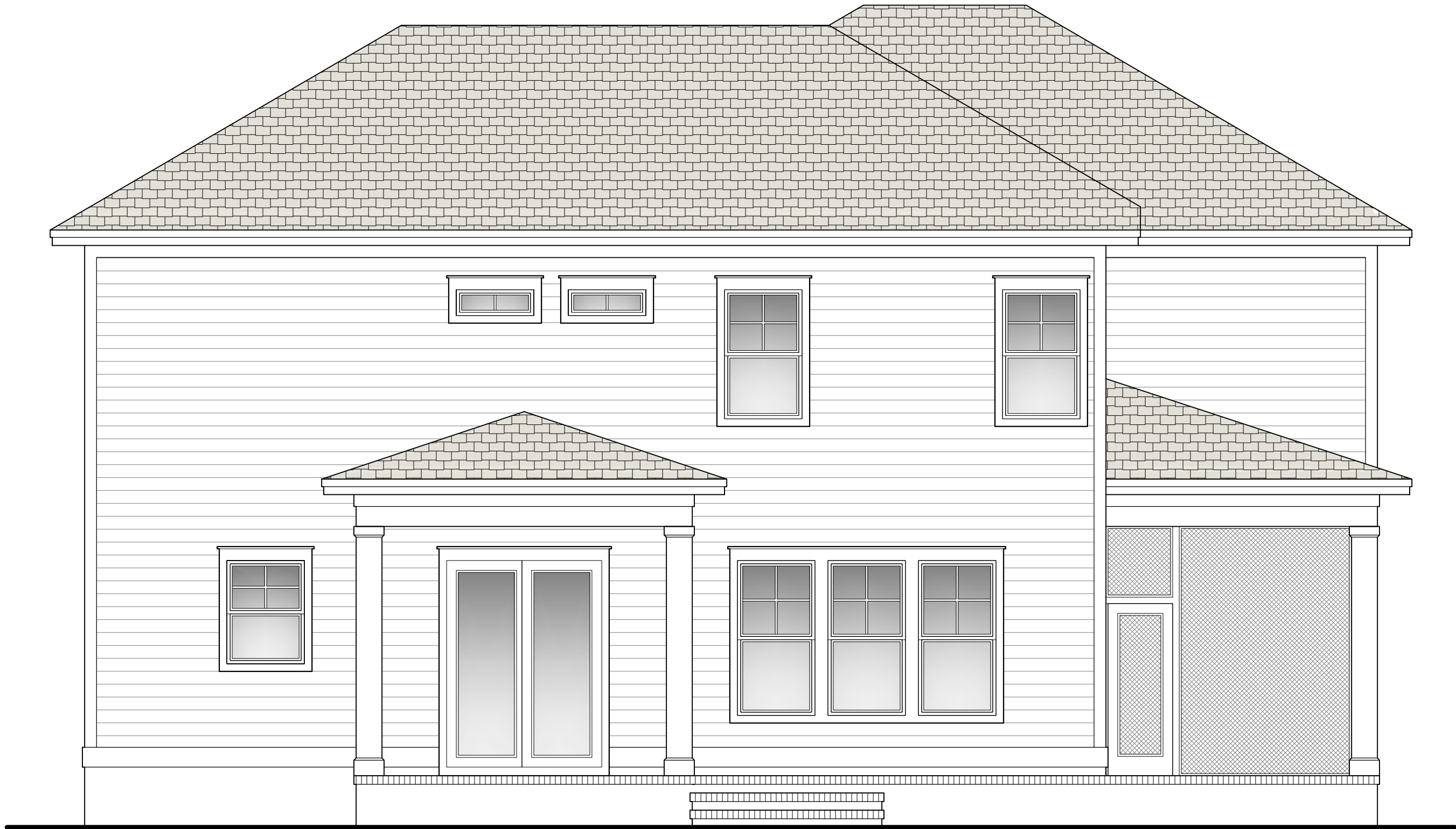
1 A5 REAR ELEVATION SCALE: 1/4" = 1'

FLOOR PLANS OR ELEVATIONS ARE FOR ILLUSTRATIVE PURPOSES ONLY. THE ACTUAL HOME, AS BUILT, MAY DEVIATE FROM THE PLANS OR ELEVATIONS BECAUSE OF PERSONAL SELECTIONS, ENGINEERING CONSTRAINTS OR FIELD CONDITIONS.