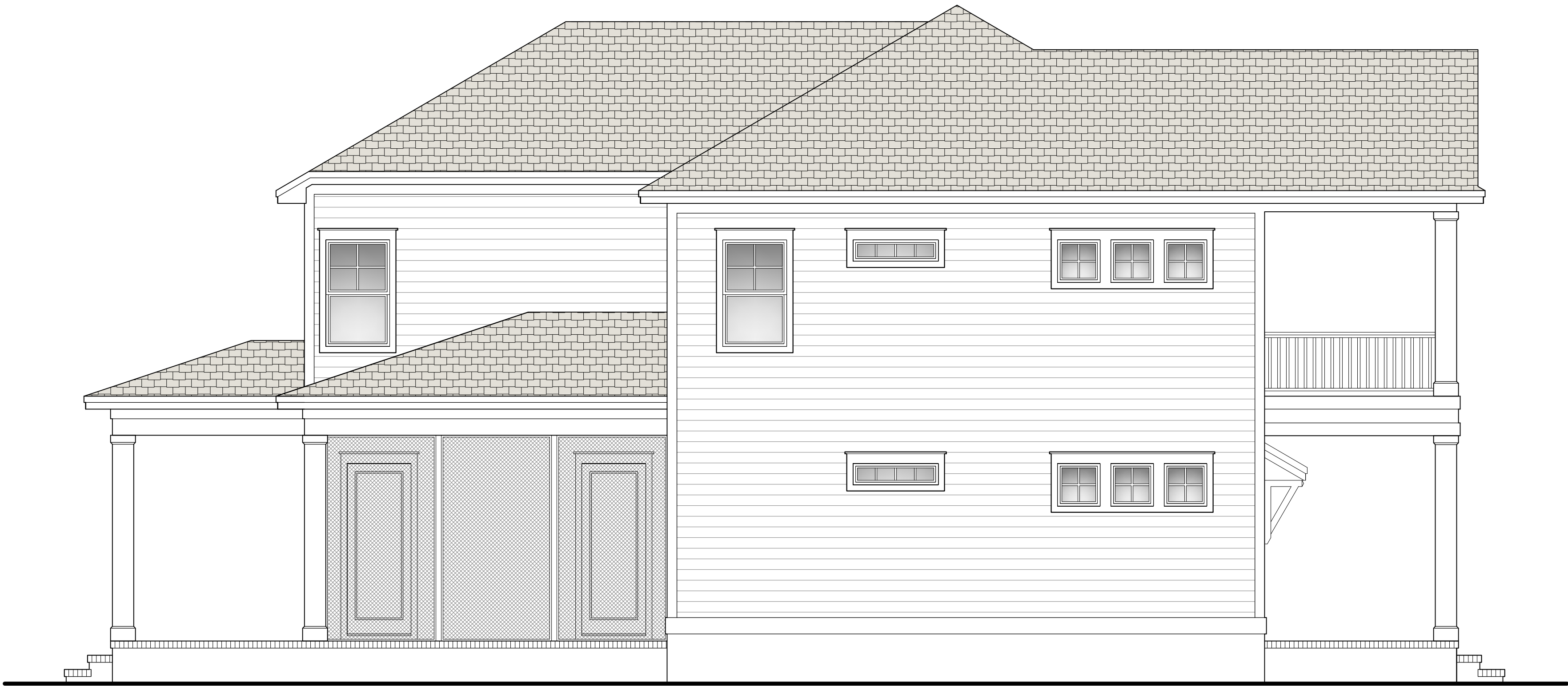
2 LEFT ELEVATION A4 SCALE: 1/4" = 1'

© COPYRIGHT 2022 RICHARD WALLACE BUILDER