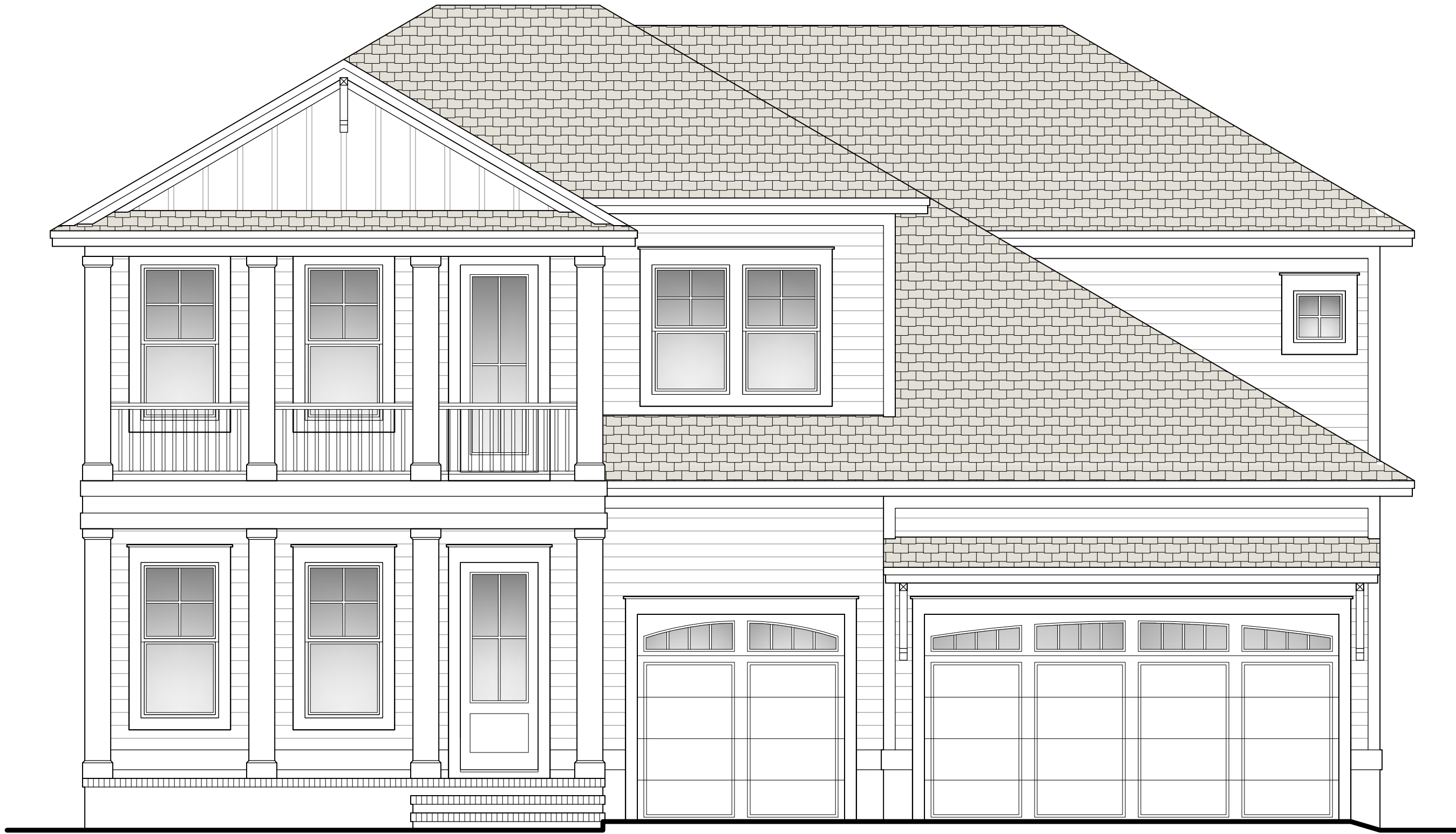
1 FRONT ELEVATION A4 SCALE: 1/4" = 1'